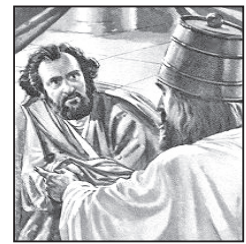
Many are invited, but few are chosen. Matthew 22:14

Prayer Lord, I come before You today in need of Your healing hand. In You all things are possible. Hold my heart within Yours, and renew my mind, body, and soul. I am lost, but I am singing. You gave us life, and You also give us the gift of infinite joy. Give me the strength to move forward on the path You've laid out for me. Guide me towards better health, and give me the wisdom to identify those You've placed around me to help me get better. In your name I pray, Amen.