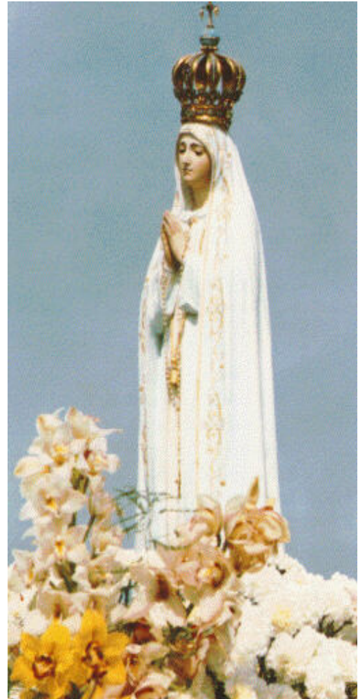
The Home Pilgrim Statue of Our Lady of Fatima