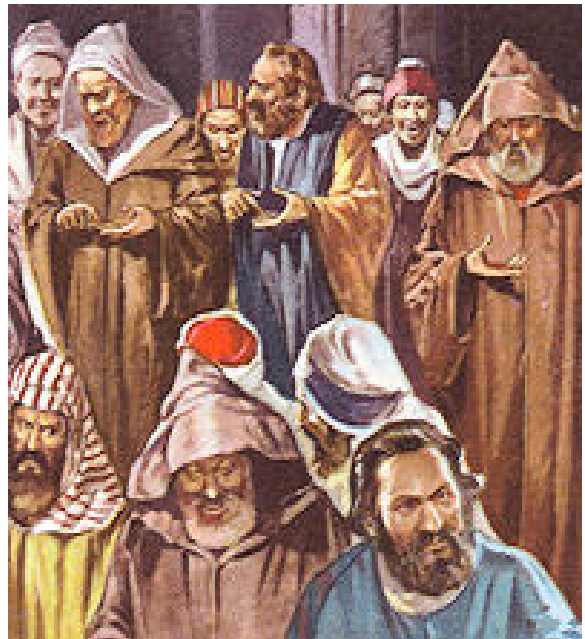
Are you envious because I am generous? Thus, the last will be first, and the first will be last. Matthew 20:16