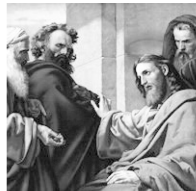
Jesus said, "Therefore what God has joined together, no human being must separate."