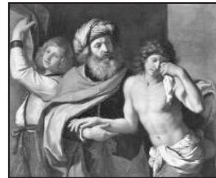
"There will be rejoicing among the angels of God over one sinner who repents." Luke 15:10